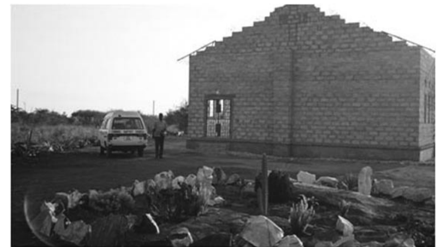
Evangel Baptist Church Building

Overall, Church members have shown some commitment to Church programmes and we believe that this can be bettered. We thank the members for remaining united and we look forward to a better 'Evangel Baptist Church' during the year 2008. May the Lord Jesus richly bless you all – Amen.