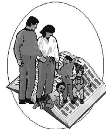
Committed to God and the Word of His grace. Acts 20:32

We at Germiston Baptist continue to praise the Lord and give thanks to Him for His many blessings and all that He continues to do in and through us as a body. "[W]e have this treasure in jars of clay to show that this all-surpassing power is from God and not from us". (2Cor. 4:7)